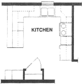
OPTIONAL KITCHEN LAYOUT